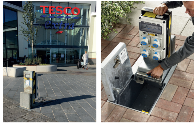
▲ Hampton, Peterborough

A range of standard sized units are held in stock for fast despatch, whilst special designs such as integrated data, utilities and metering kits are available on request.