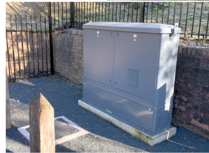
▲ Bedlam Furnaces, Telford