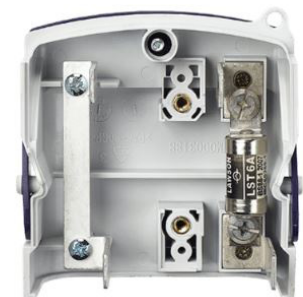
Internal view of a single fuse carrier fitted with Lawson LST fuse