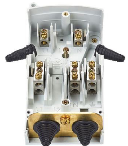
Example of internal view of cut out